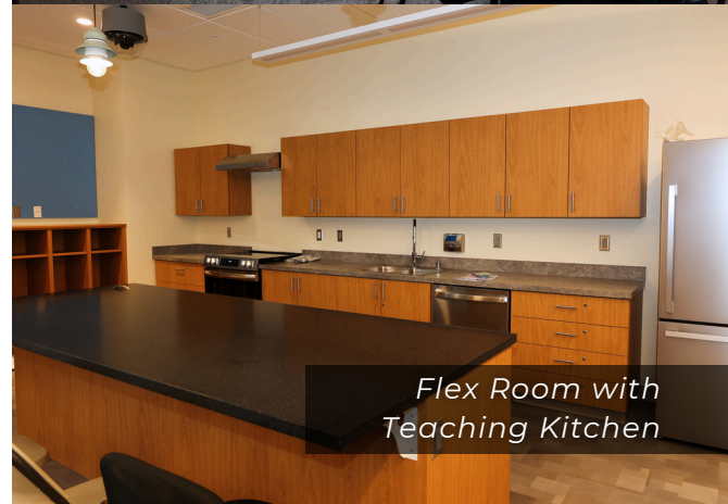
Flex Room with Teaching Kitchen