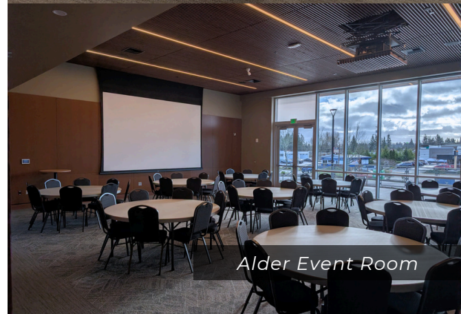
Alder Event Room