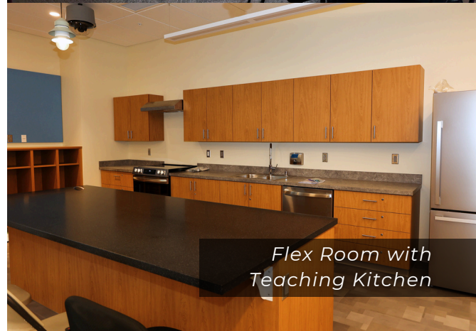
Flex Room with Teaching Kitchen