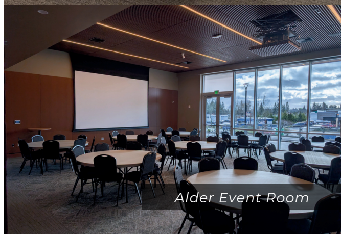
Alder Event Room