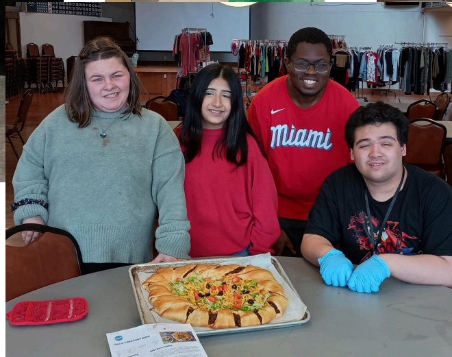
Goal Students cooking class: Delicious Taco Crescent Ring!