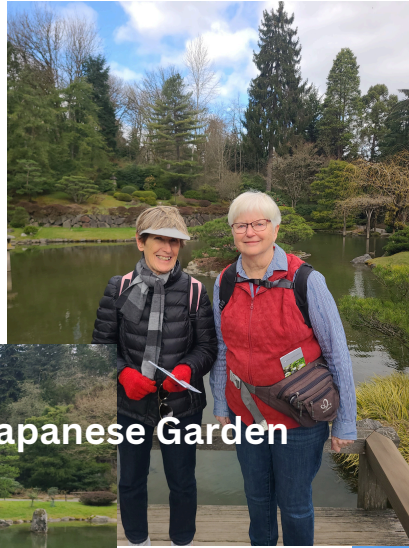
Seattle's Japanese Garden