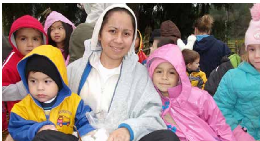
Every family needs a support system. For many families in Sultan, VOAWW fills that role.

The Sky Valley Family and Community Resource Center is a prime example of how Volunteers of America Western Washington uses its resources to bring together their services, other providers, and energy that already exists in a community to benefit local residents. Once referred to as Sultan's Human Services Department by the Mayor, this neighborhood center provides a wide range of needed services. These wrap-around capabilities include a state funded preschool, before and after school child care, safe youth activities, food bank services, mental health counseling, conflict resolution/mediation, low-cost meals for seniors, housing assistance, support for individuals with disabilities, volunteer opportunities, and information about other services.