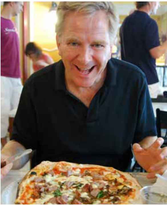
Guidebook author and travel TV host Rick Steves .